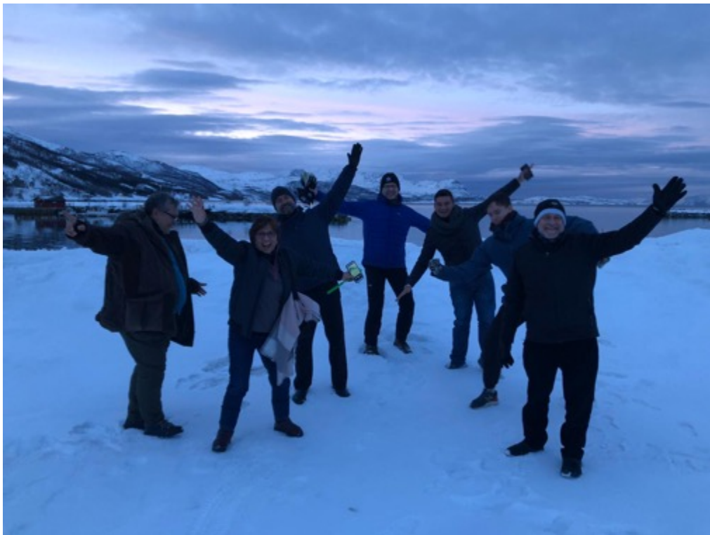
In Sørkjosen, preparing for the visit to Sami Way.

In between meetings and driving from place to place, we had time to visit some of what Norway has to offer incl. museums, cathedrals, ice-hotels, cable-cars, night tour with reindeers and so on. Here are some highlights: