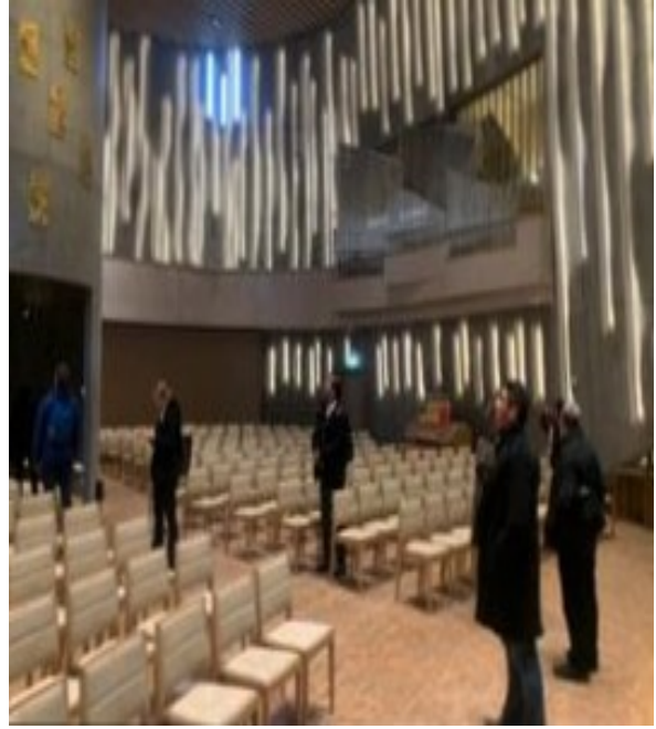
At the Northern Lights Cathedral in Alta